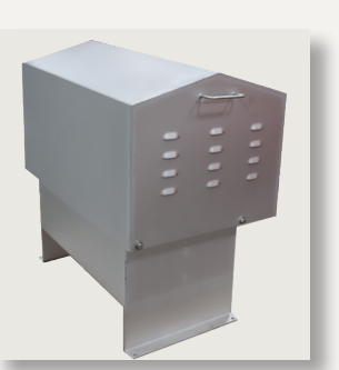
Stainless wash-down power pack cover