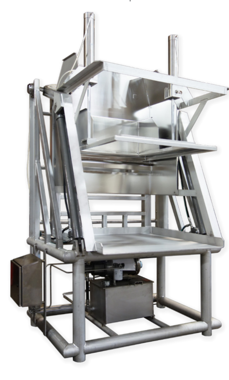
LD3000 Elevated height Lift Dumper with passivated finish and safety guarding (one side removed for photo)