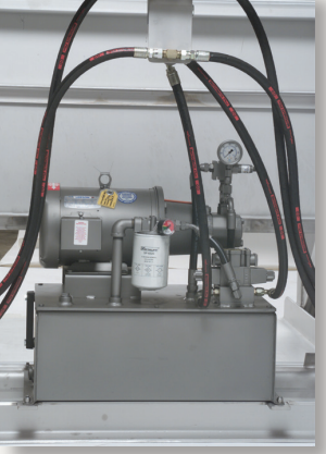
Hydraulic power pack is available on DP3000, HD3000 and

Loading heights, capacity and cycle times can be customized to fit the needs of specific applications.