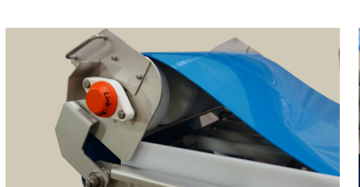
Manual Lift-up Idle End