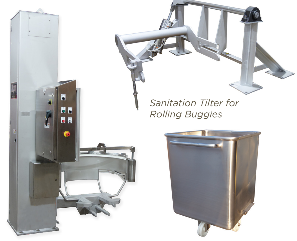
Column Dumper showing mixing bowl carriage