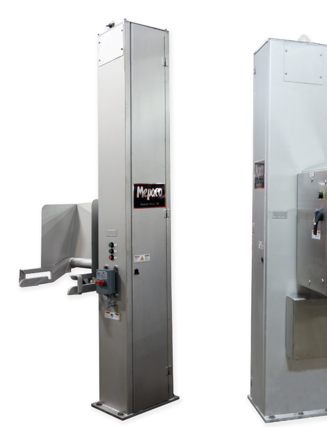
Column Dumper showing extended dump chute